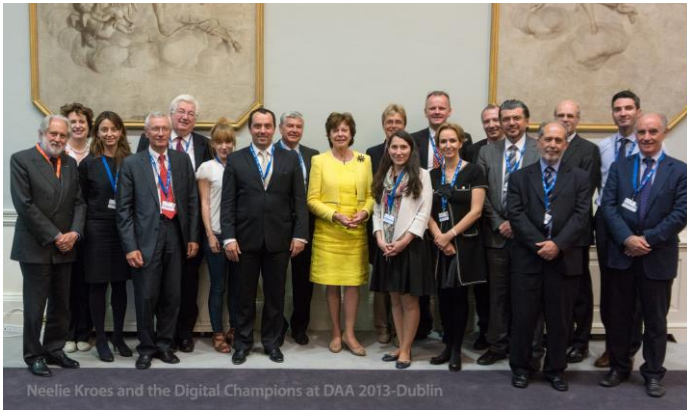
Neelie Kroes and the Digital Champions at DAA 2013-Dublin